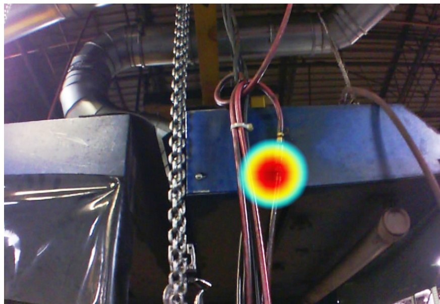
Images taken with the ii900 Sonic Industrial Imager in an industrial environment.

Fluke. Keeping your world up and running.®